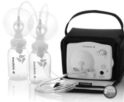
Medela PNS Advanced

A Personal Use Pump (PUP) is designed for minor problem solving or for mothers who require a pump for returning to work or school. MilkWorks provides a choice of either the Medela Pump In Style Advanced or the Spectra S2. Both PUPs are proven effective for most breastfeeding mothers and may be obtained during pregnancy or after delivery.