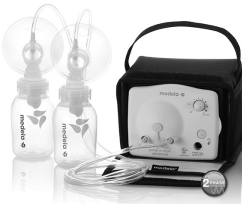
Medela Pump in Style

A Personal Use Pump (PUP) is designed for minor problem solving or for mothers who require a pump for returning to work or school. MilkWorks provides either the Medela Pump in Style Advanced Starter Set or the Spectra S2 Plus. Both PUPs are effective for most breastfeeding mothers and may be obtained during pregnancy or after delivery.