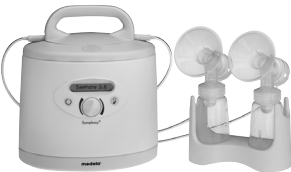
Medela Symphony Medical Need Rental Pump

A Personal Use Pump (PUP) is designed for minor problem solving or for mothers who require a pump for returning to work or school. MilkWorks provides either the Medela Pump in Style Advanced Starter Set or the Spectra S2 Plus. Both PUPs are effective for most breastfeeding mothers and may be obtained during pregnancy or after delivery.