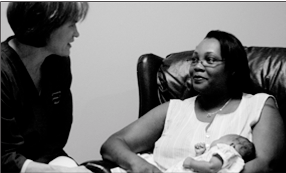
Creating a healthier community by helping mothers breastfeed their babies.